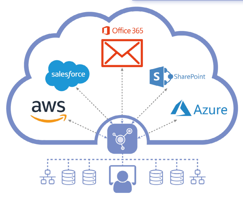
Antigena Email is the only solution that analyzes data across the digital business and in light of new evidence – whether that evidence is made manifest in email, or in emerging behaviors in the network.

Antigena Email is the first and only solution that does this.