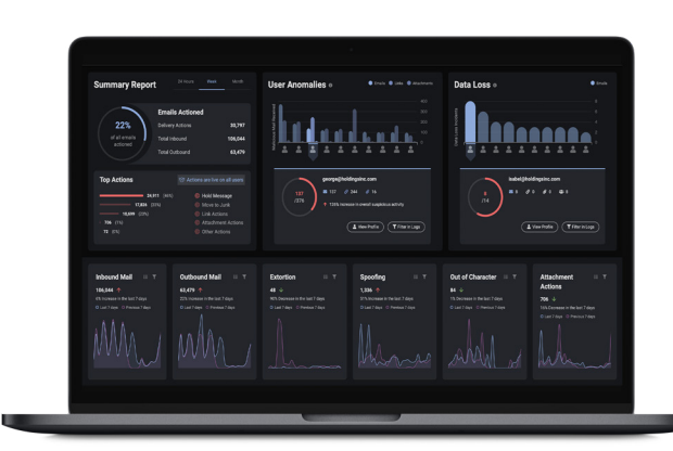
Antigena Email's intuitive user interface highlights threat trends over time

Antigena Email is powered by Darktrace's core Al engine. Leveraging a combination of unsupervised and supervised machine learning, Darktrace's Cyber Al 'learns on the job' to detect subtle forms of unusual behavior in their earliest stages. By taking this approach, Antigena Email catches threats that other tools repeatedly miss, such as malicious emails coming from compromised accounts of trusted suppliers, as well as threats that employ never-before-seen attack vectors.